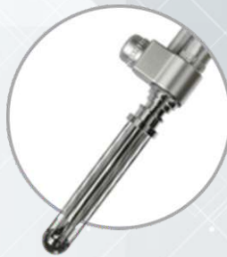
VAGINAL PROBE 3