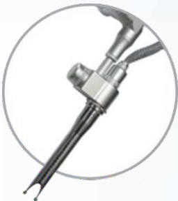
VAGINAL PROBE 1