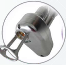
FRACTIONAL CO2 LASER