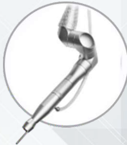
NORMAL CO2 LASER