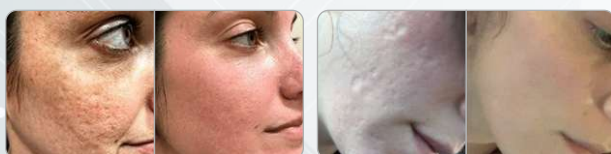
BEFORE AFTER BEFORE AFTER