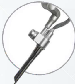
VAGINAL PROBE 2